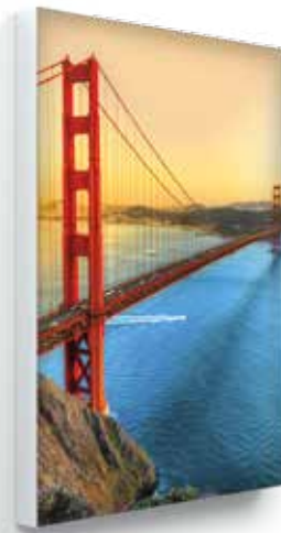
Slim Profile Light Boxes