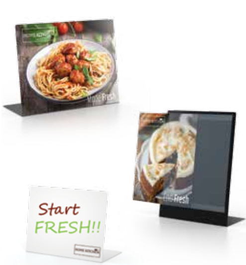
Plastic Pocket and Magnetic SignBacks™