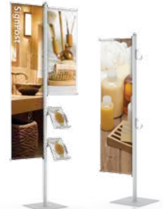
SignPost Banner Stands™