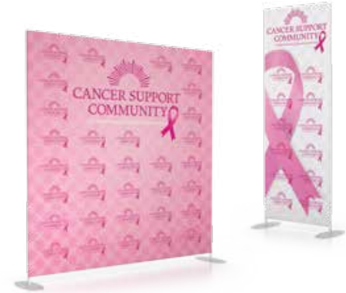
Straight Flat Walls & Visual Graphic Stands™