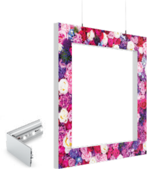
Custom Light Boxes (Minimums apply)