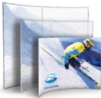
Cool C Walls™