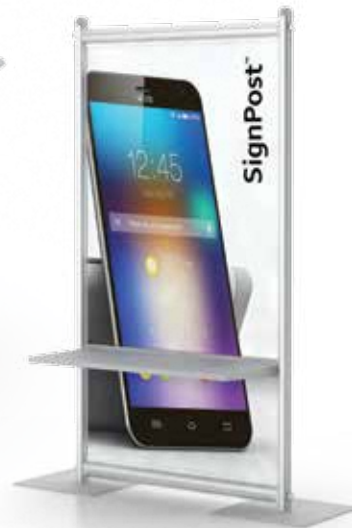
SignPost Rigid Graphic Stands™