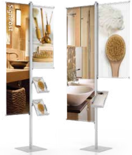
SignPost Banner Stands™