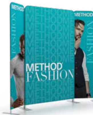
Scenic Fabric Walls™