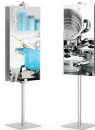
SignPost Literature Stands™