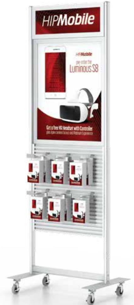
Custom Slatwall Stands