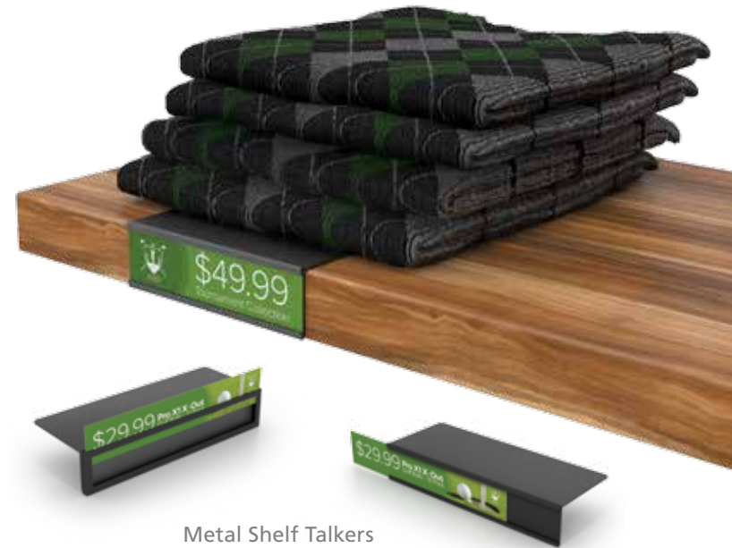
Metal Shelf Talkers