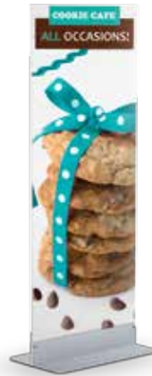
Adj. Double L Mounts™