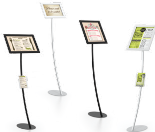
Angled EasyOpen SnapFrame Pedestal Stands™