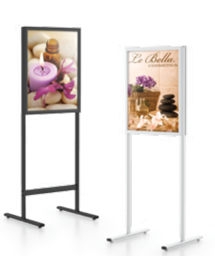
EasyOpen SnapFrame Stands™