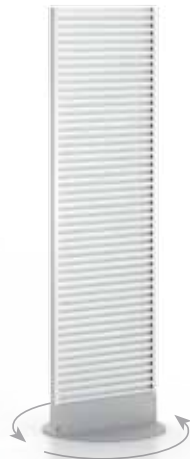
Revolver Slatwall Stands™