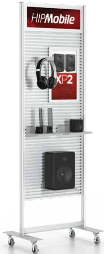
Portable Slatwall Stands™

PORTABLE DISPLAYS - PANELS - SPECIALTY DISPLAYS