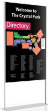
Fixed Width Skyscraper Mounts™