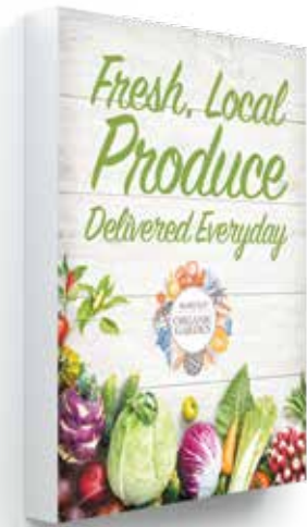
Single Sided Light Boxes