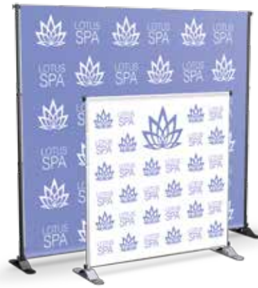
Adjustable Large/Grand Format™