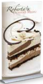
Super Click Mounts™