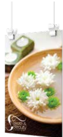
Visual Merchandising Clamps™