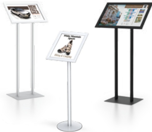
EasyOpen SnapFrame Pedestal Stands™