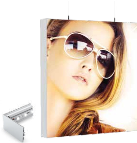
Lightwire Electrified Cables