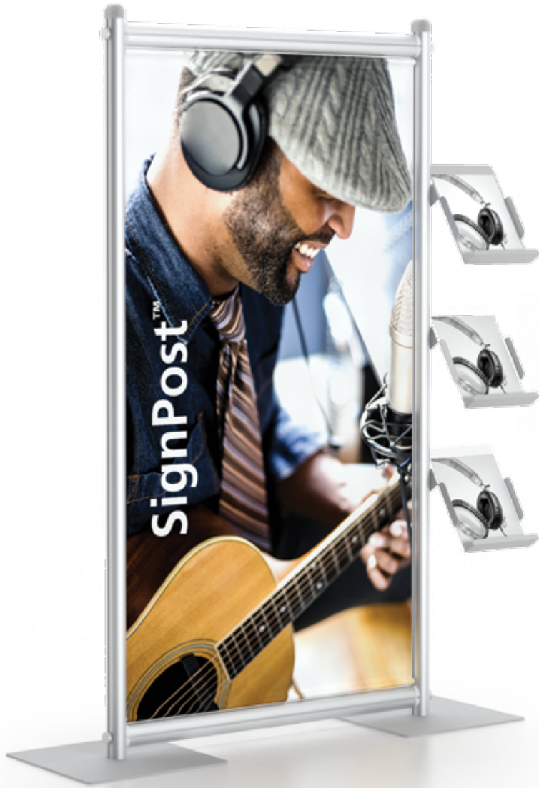
SignPost Double Upright™