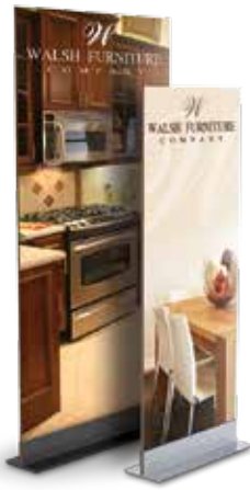
Double L Mounts™