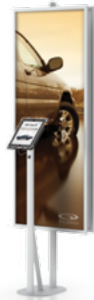
Hybrid iPad Stands™