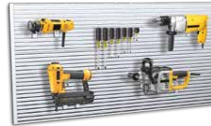
Single Sided Wall Mount Panels