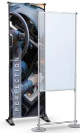
Classic Fixed Width™