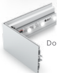
Double Sided Light Boxes