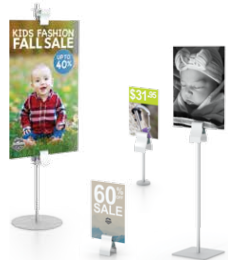
Visual Merchandising Clamps™