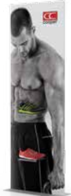
Harmony Banner Stands™