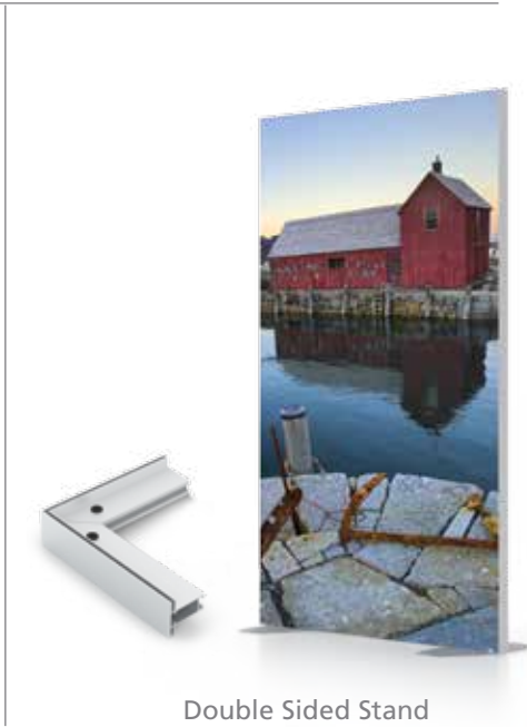
Double Sided Stand