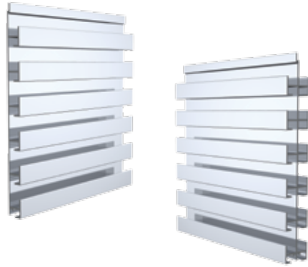
Bulk Slatwall 1" on Center - Satin Anodized