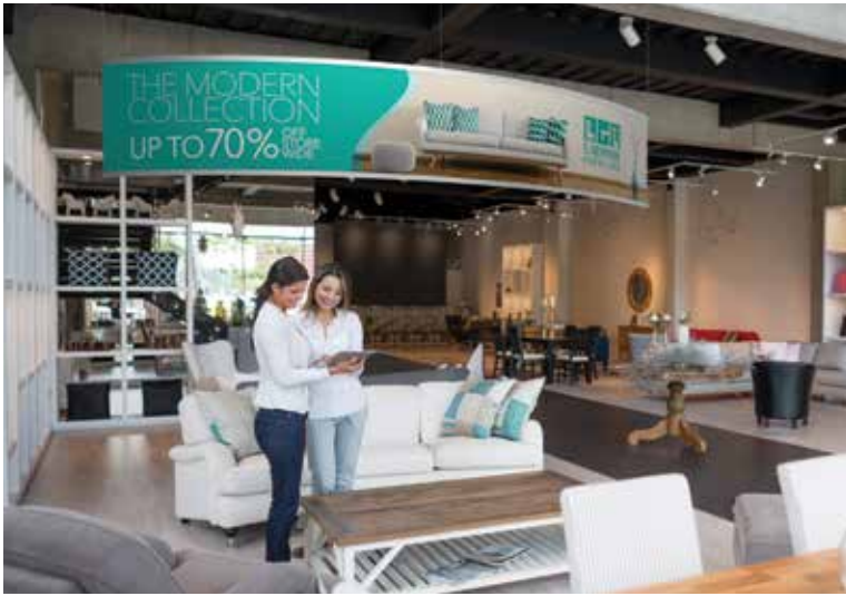
Custom Halo Rails™ Freeforms