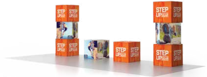
Horizon Pillowcase™ Large Format Hanging Structures - Cubes, Rectangles & Triangles